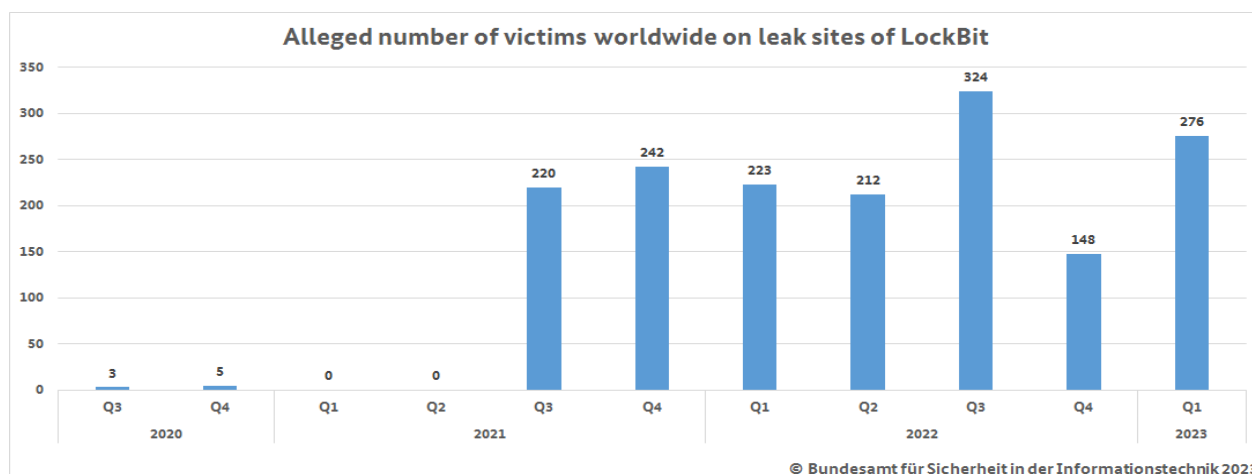
Figure 2: Alleged Number of Victims Worldwide on LockBit Leak Sites

Up to the Q1 2023, a total of 1,653 alleged victims were observed on LockBit leak sites. With the introduction of LockBit 2.0 and LockBit 3.0, the leak sites have changed, with some sources choosing to differentiate leak sites by LockBit versions and others ignoring any differentiation. Over time, and through different evolutions of LockBit, the address and layout of LockBit leak sites have changed and are aggregated under the common denominator of the LockBit name. The introduction of LockBit 2.0 at the end of the Q2 2021 had an immediate impact on the cybercriminal market due to multiple RaaS operations shutting down in May and June 2021 (e.g., DarkSide and Avaddon). LockBit competed with other RaaS operations, like Hive RaaS, to fill the gap in the cybercriminal market leading to an influx of LockBit affiliates. Figure 2 shows the alleged number of victims worldwide on LockBit leak sites starting in Q3 2020.